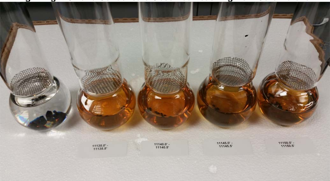
Fig. 1 Light Oil and Condensate Observed Leaching from Core Material

As previously reported, light oil and condensate was observed leaching from core material, confirming the presence of liquid hydrocarbons at the Icewine#1 location (see graphic below). This further supports the core and geochemical analysis that the thermal maturity window at Icewine#1 is consistent with pre-drill modelling. Final thermal maturity data is expected within 7 days.