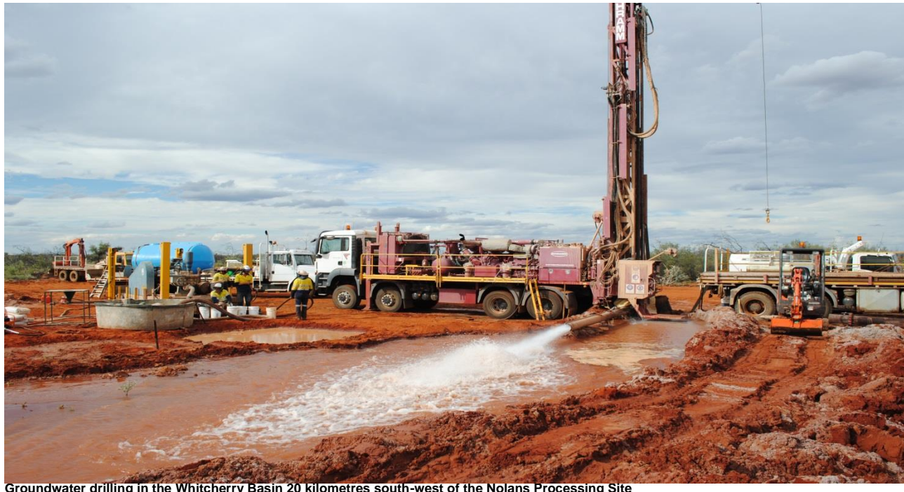
Groundwater drilling in the Whitcherry Basin 20 kilometres south-west of the Nolans Processing Site

Arafura is in advanced discussions with Northern Territory Government regulators to agree on a process aimed at securing long-term water extraction rights for the Nolans Project.