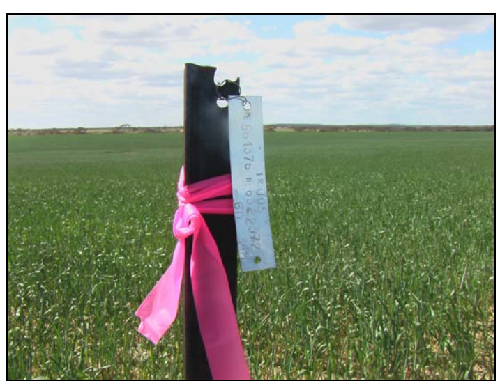
Warramboo drill hole location