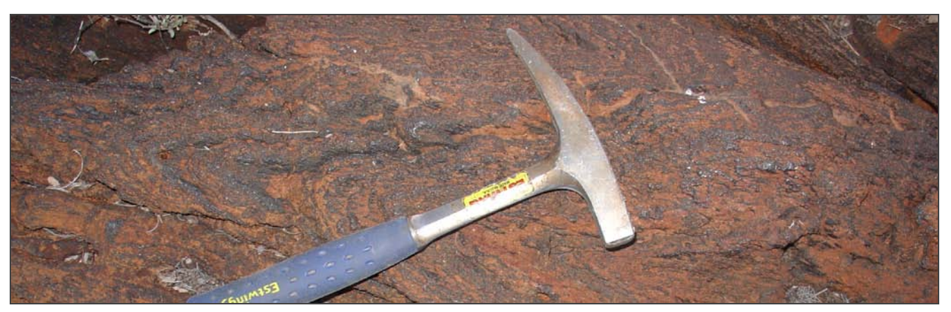
Mount Christie Banded Iron Formation

Iron Road intends to investigate the potential of its Murchison projects, particularly beneath the surface alluvial and colluvium cover.