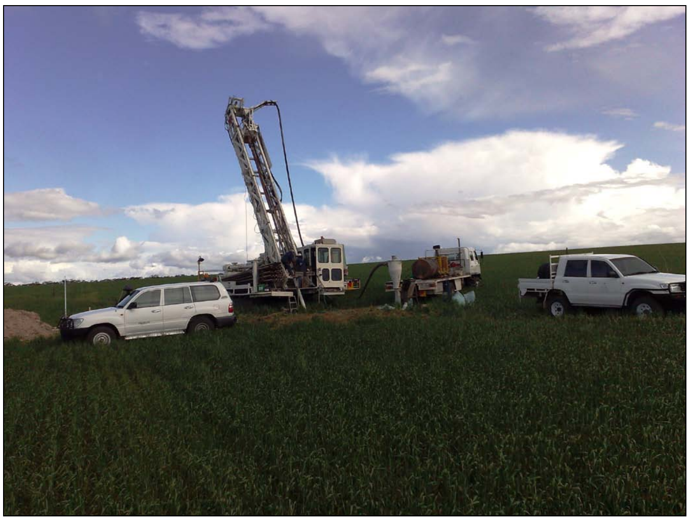
Iron Road's inaugural drilling programme at Warramboo