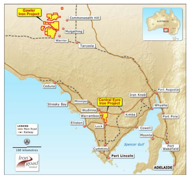
Figure 3 - South Australia project location map

Iron Road's principal project is the Central Eyre Iron Project in South Australia (Figure 3). This project is complemented by early stage projects prospective for iron ore mineralisation in Western Australia (Windarling, Murchison) and South Australia (West Gawler).