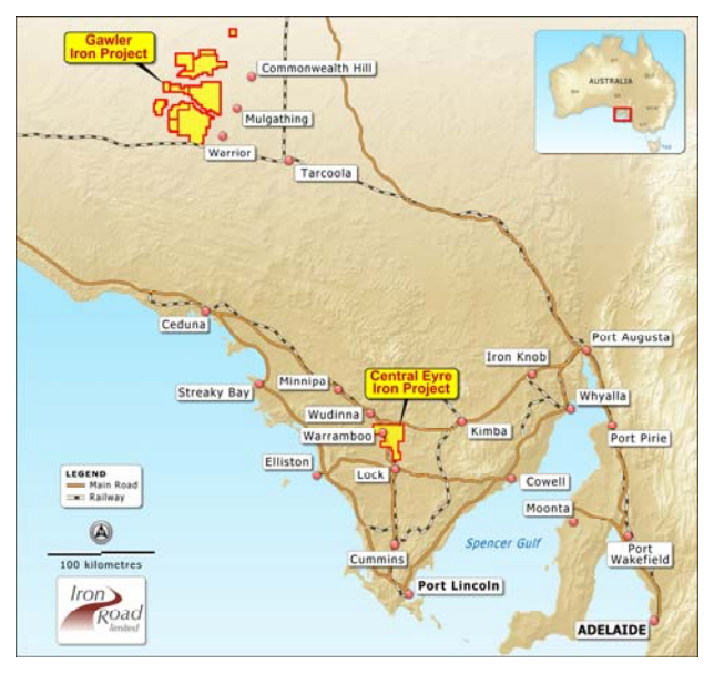
Figure 3 - South Australia project location map