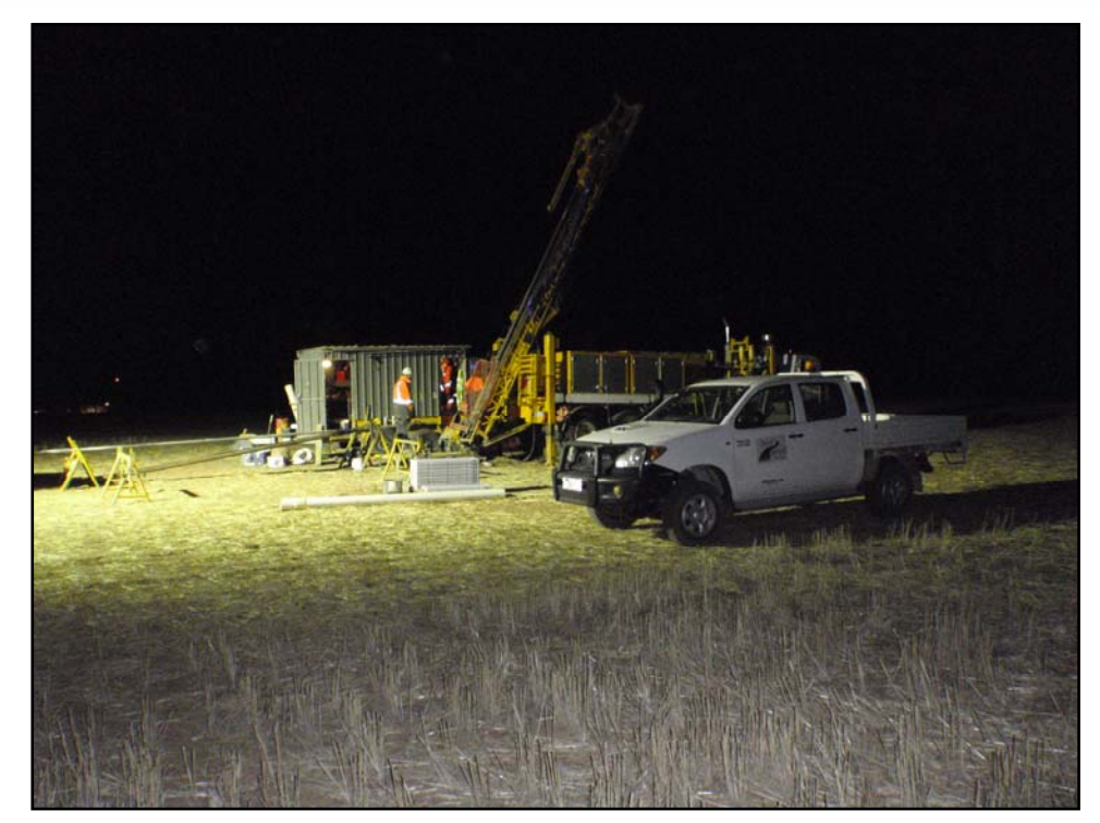
Figure 2 – Diamond rig under floodlights during night shift drilling.