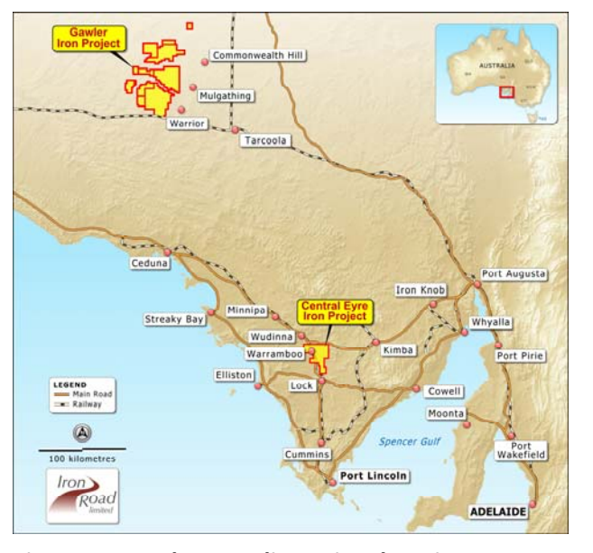
Figure 3 - South Australia project location map

FD Third Person Tel: +61 8 9386 1233 Mob: +61 (0)420 945 291 / +61(0)439 841 395 Email: shane.murphy@fdthirdperson.com.au / sarah.browne@fdthirdperson.com.au