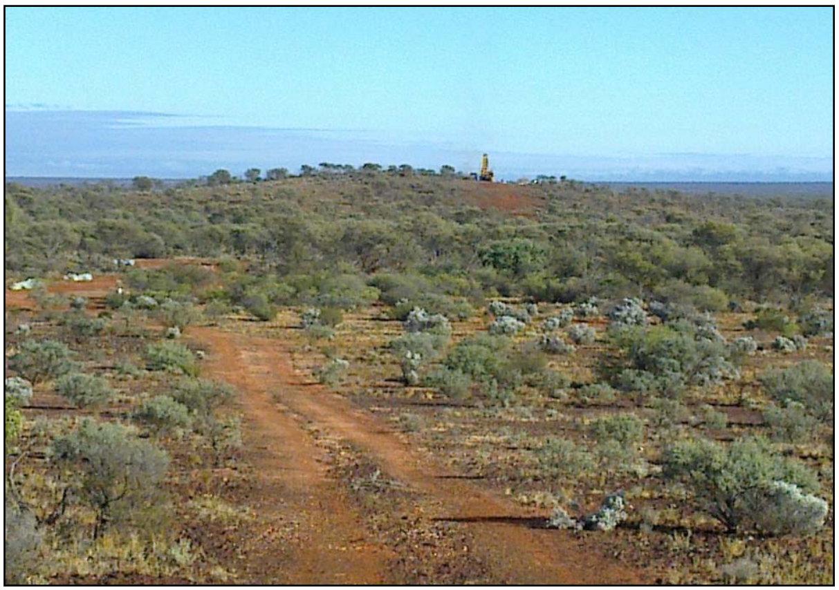
Figure 2 – RC drill rig at North West Fingerpost Hill 1.