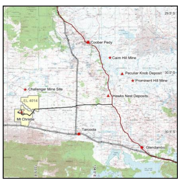
Figure 1- Location of drilling at the Gawler Iron Project

Six priority prospects have been identified from Stage I RC drilling as targets, supplemented by the analysis of high resolution magnetic and gravity data (Figure 2).