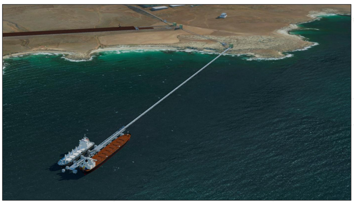
Artist's rendering of Handymax and Capesize Vessel docked at proposed port for loading