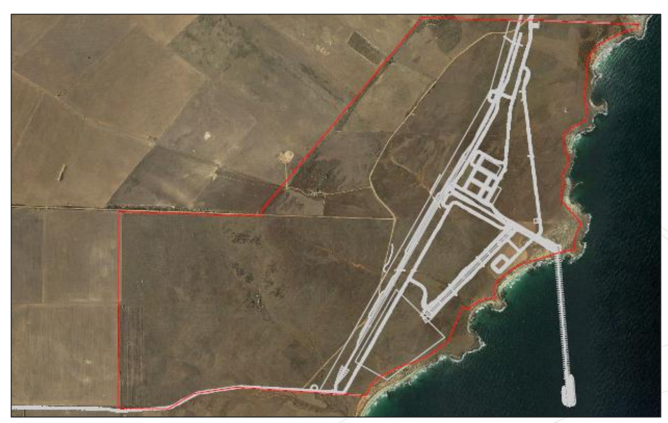
Land secured outlined in red, proposed infrastructure in white

A number of ether port options on the east coast of the Eyre Peninsula have been proposed by others to service the region's growing number of mining and primary industry exporters. Environmental, community, technical and economic challenges related to each of these options were carefully reviewed before Iron Road settled on its preferred site at Cape Hardy.