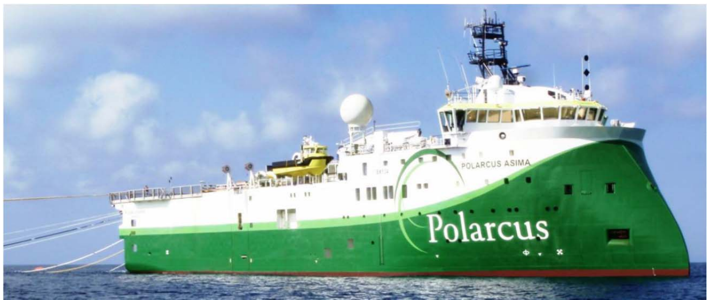
Figure 1- Seismic Survey Vessel Polarcus Asima

3 Paragon Oil & Gas (Pty) Ltd is a wholly owned subsidiary of Paragon Investment Holding's (Pty) Ltd