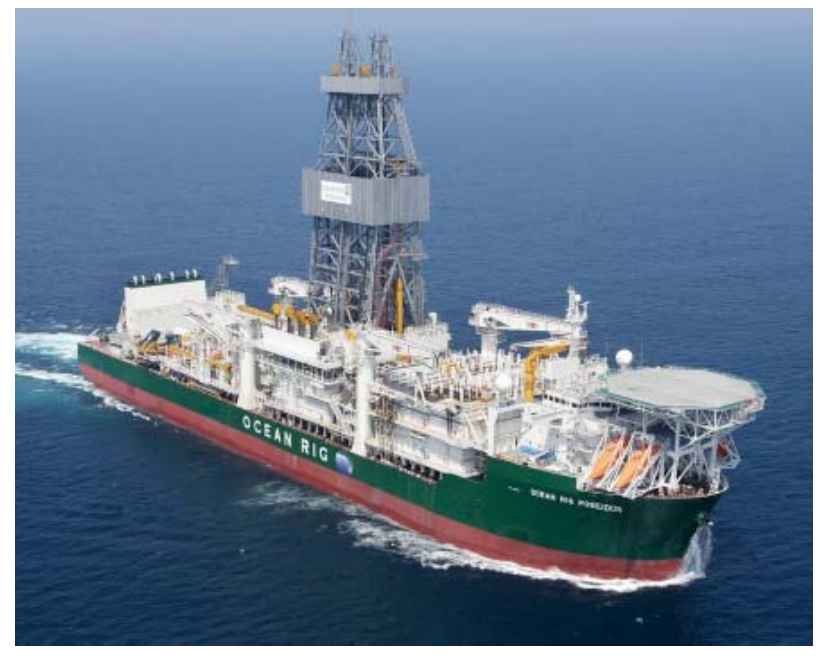
Ocean Rig Poseidon - Contracted to drill Cormorant-1

Operator Tullow Namibia Limited ("Tullow"), a wholly owned subsidiary of Tullow Oil plc (LON: TLW) is well underway with preparations for the commencement of drilling of the