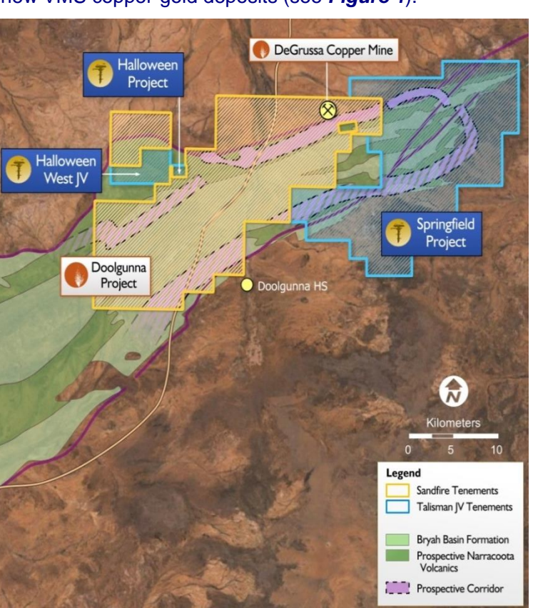
Figure 1 - Talisman's Doolgunna Copper-Gold Projects showing interpreted extension of the DeGrussa Mine Corridor

Sandfire has already identified a combined 65km strike length of prospective Volcanogenic Massive Sulphide (VMS) horizon across the combined Talisman and Sandfire tenements, providing a significantly expanded search horizon for potential new VMS copper-gold deposits (see Figure 1 ).