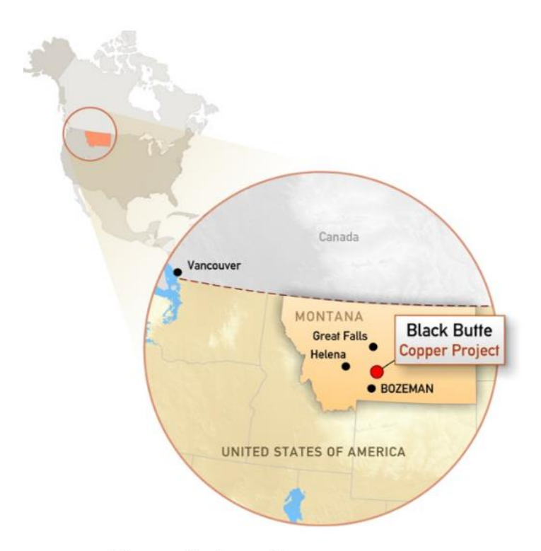
Figure 1: Location map Black Butte Project, Montana

In addition, Tintina will issue Sandfire with 20 million two-year Class A warrants exercisable at C$0.28 per share, 20 million three-year Class B warrants exercisable at C$0.32 per share and 40 million five-year Class C warrants exercisable at C$0.40 per share. If these warrants are exercised, Sandfire's interest would increase to 53% (undiluted) giving it a clear path to control of the Company and the project. <sup>1</sup>