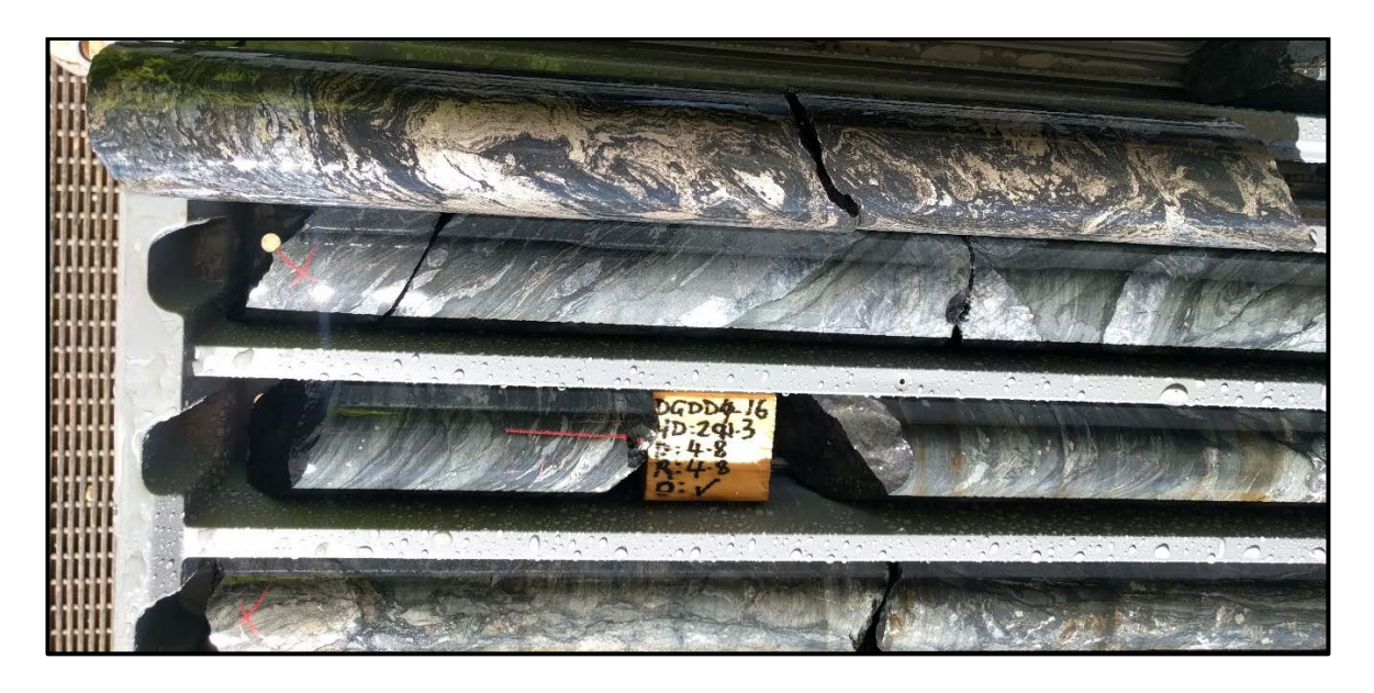
Plate 1. Core from Sandfire Hole DGDD416 at 294.3m Downhole