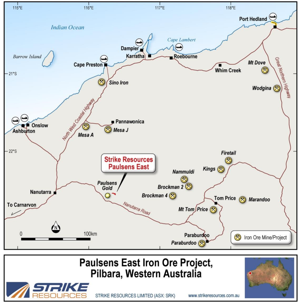
Figure 1: Paulsens East Project and Port Locations