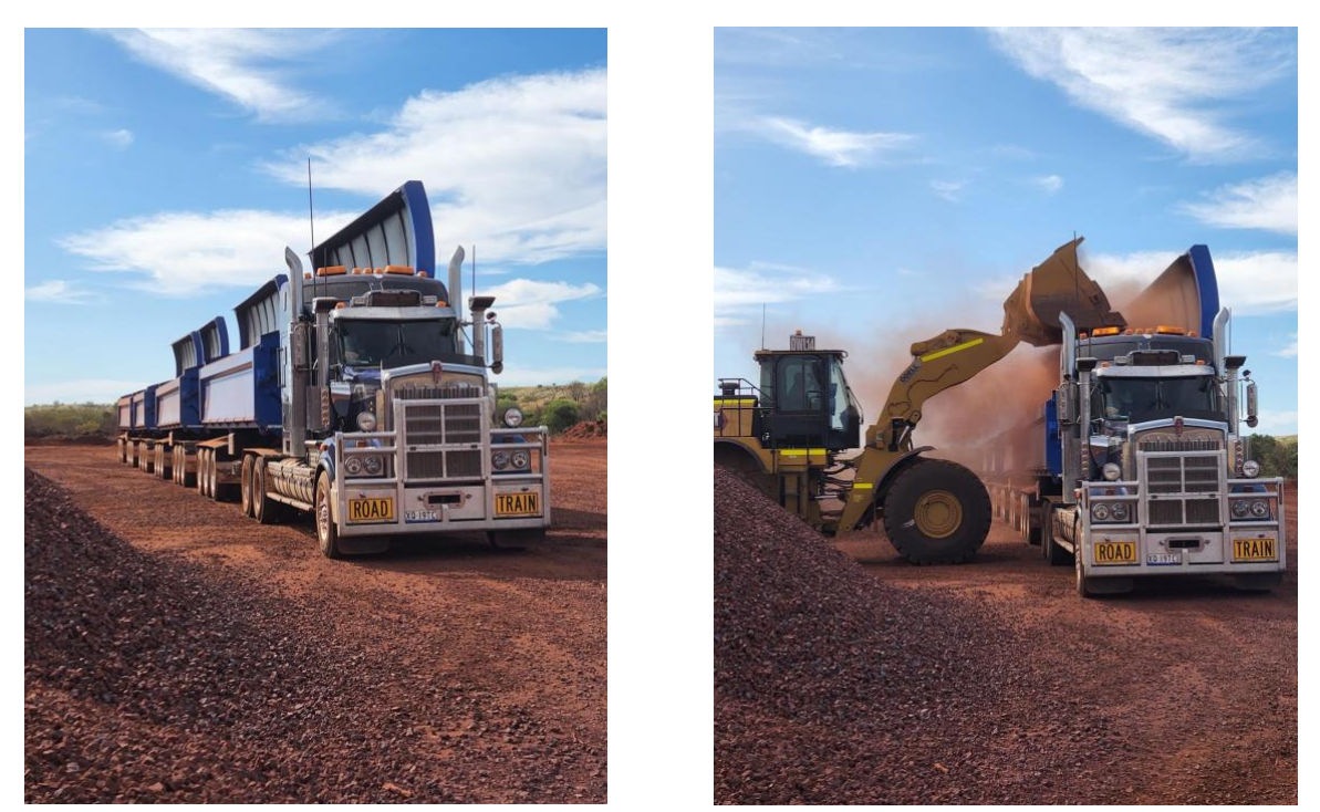
Figures 1 and 2: Loading Paulsens East Lump DSO on to Road Train

Odell Mining Services has commenced the haulage of Paulsens East Lump DSO from the mine site to Utah Point.