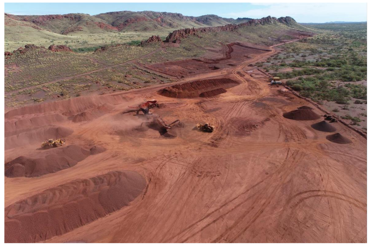
Figure 4: Stockpile area located north of Paulsens East hematite ridge with detritals mining areas in the distance