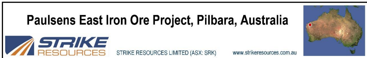
Figure 2: Paulsens East Project location and route to Beadon Creek, Onslow.

The route from Paulsens East to Onslow is good quality sealed road all the way except for a proposed 18km haul road, which Strike proposes to construct from the Project site to Nanutarra Road.