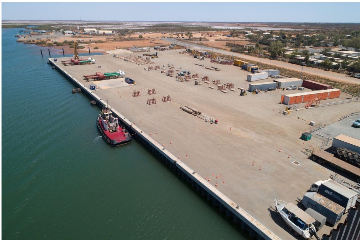
Figure 1: Onslow Marine Supply Base at Beadon Creek

The Onslow Marine Supply Base ( OMSB ) consists of a new 200 metre long wharf and associated facilities at Beadon Creek, located approximately two kilometres east of Onslow.