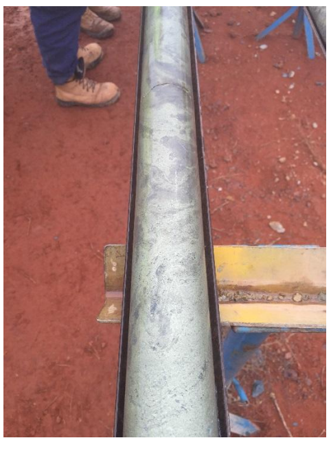
Massive sulphides with visible chalcopyrite in diamond drill core from hole TLDD0005