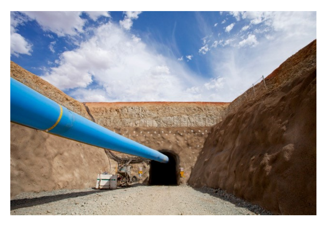
Figure 3: Monty Project: completed mine portal, December 2017