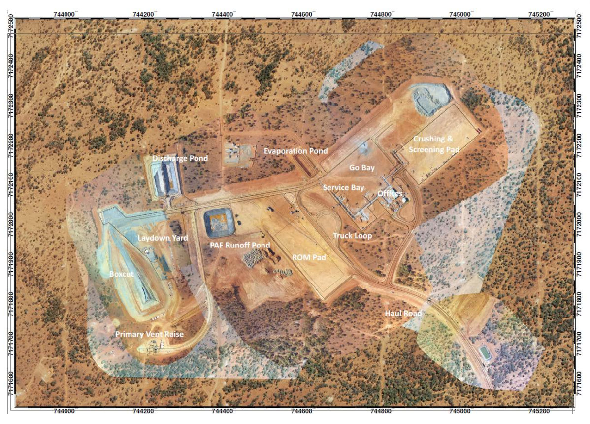
Figure 2: Monty Project: surface infrastructure layout and progress, December 2017