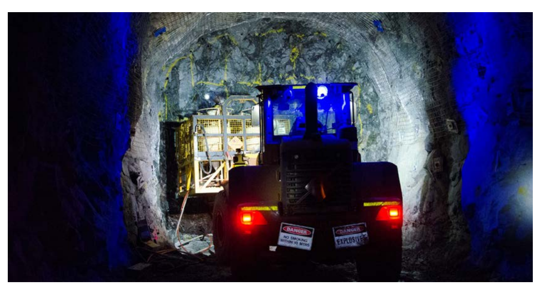
Figure 1: Monty Project: charging of the decline face, December 2017