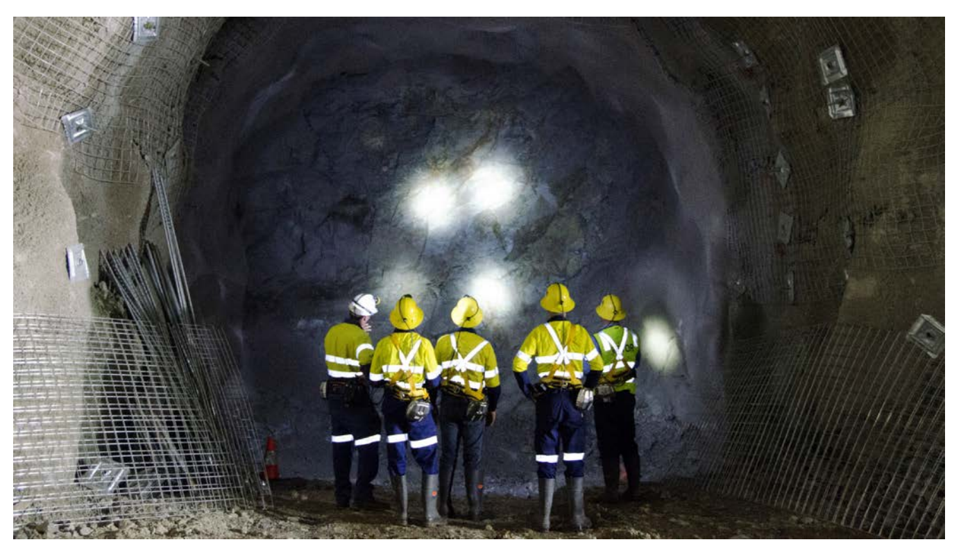
Figure 5: Monty Project: Talisman and Sandfire inspecting the return ventilation decline face, December 2017