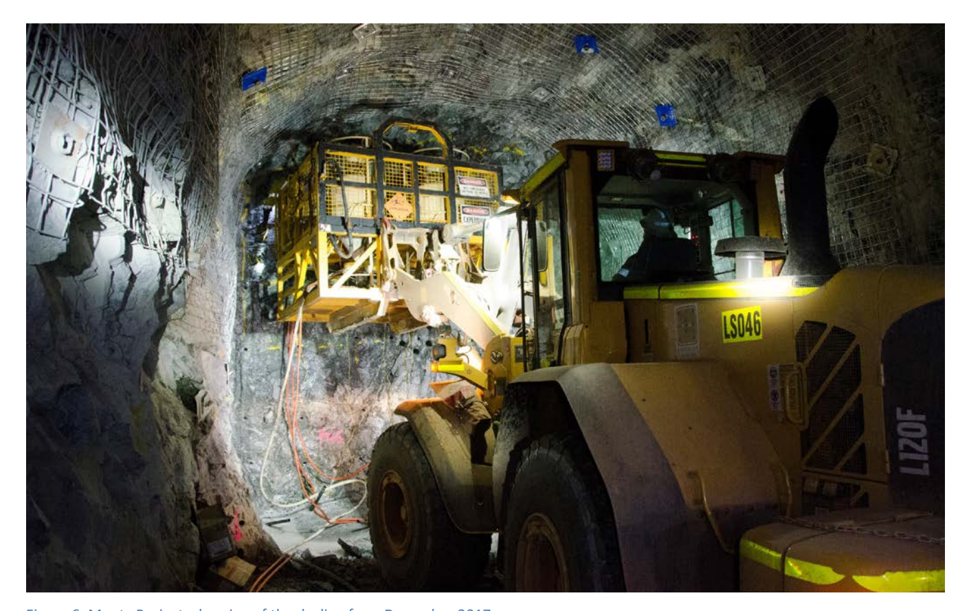
Figure 6: Monty Project: charging of the decline face, December 2017