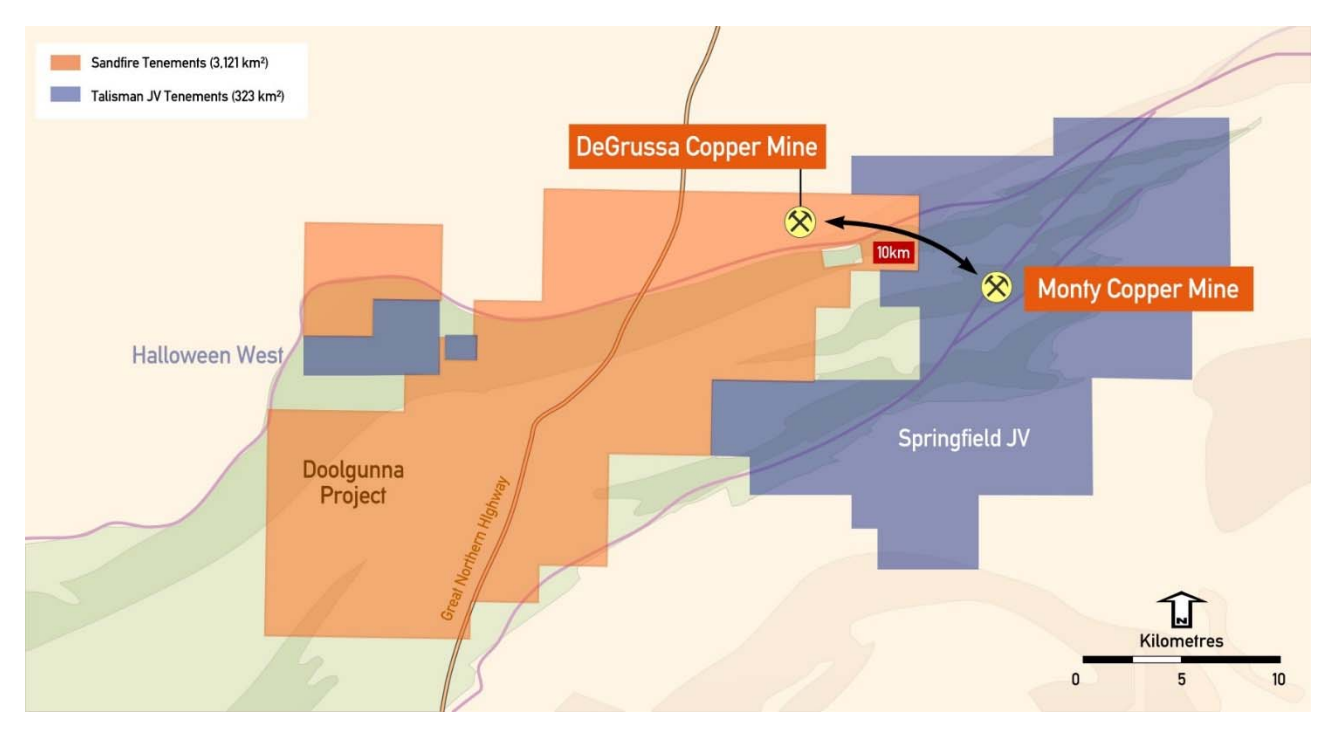
Figure 1: Location Plan showing the Springfield Joint Venture and Halloween West tenements relative to Sandfire's 100%-owned Doolgunna Project.

As previously advised, the acquisition was funded from Sandfire's existing cash reserves.