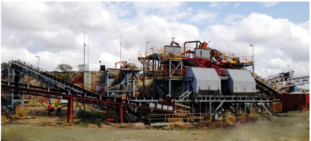
Existing Plant at Ellendale E4 site

The KDL Board has approved capital expenditure of A$11.9m plus a 20% contingency to refurbish and re-equip the E4 plant and associated infrastructure.