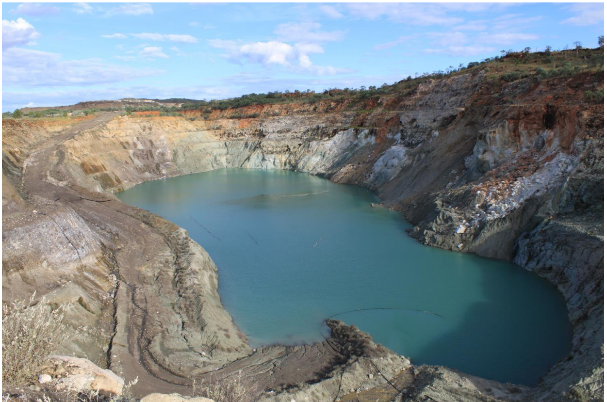
Area 22 of the E4 Pit

The E4 Satellite pipe, which has the potential to add life to the E4 operation, is located adjacent to E4. E4 Satellite has a 15.3 Mt Inferred Resource with a grade of 5.59 cpht containing 856,000 carats with an average value of $210 as per the Resource statement at 30 June 2013. This does not include the results of the E4 Satellite bulk sample as reported in the Quarterly Report for the period ended 31 December 2013.