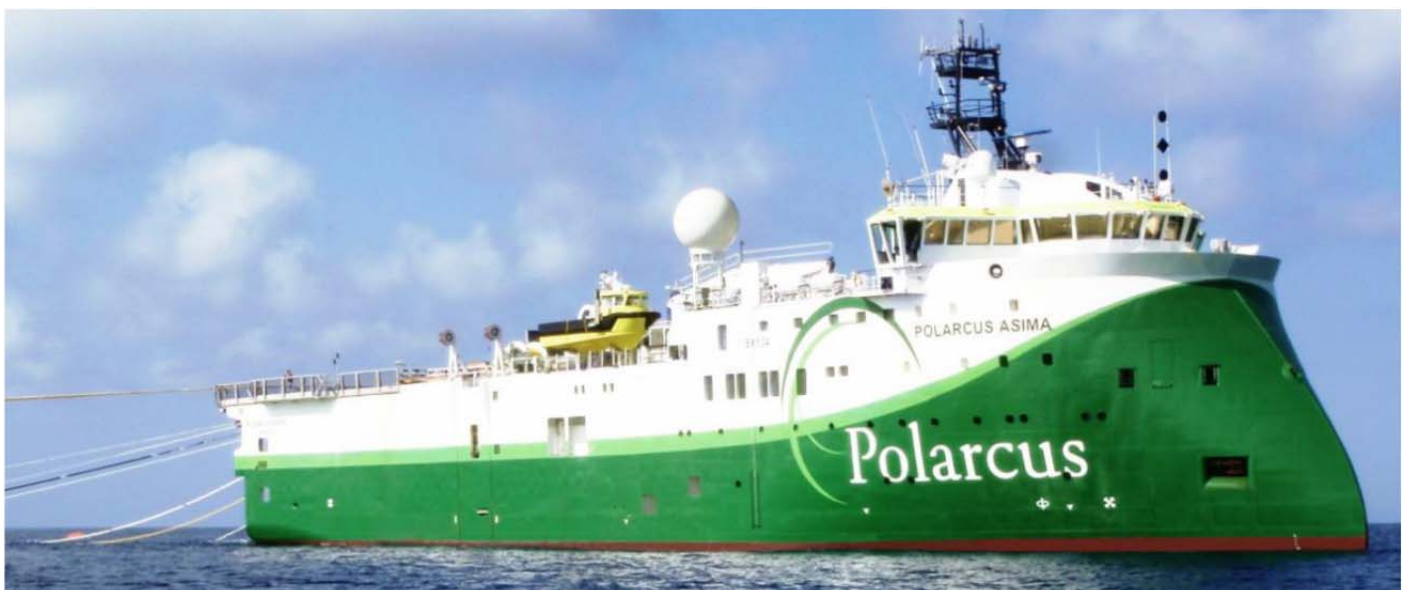
Figure 1- Seismic Survey Vessel Polarcus Asima

3 Paragon Oil & Gas (Pty) Ltd is a wholly owned subsidiary of Paragon Investment Holding's (Pty) Ltd