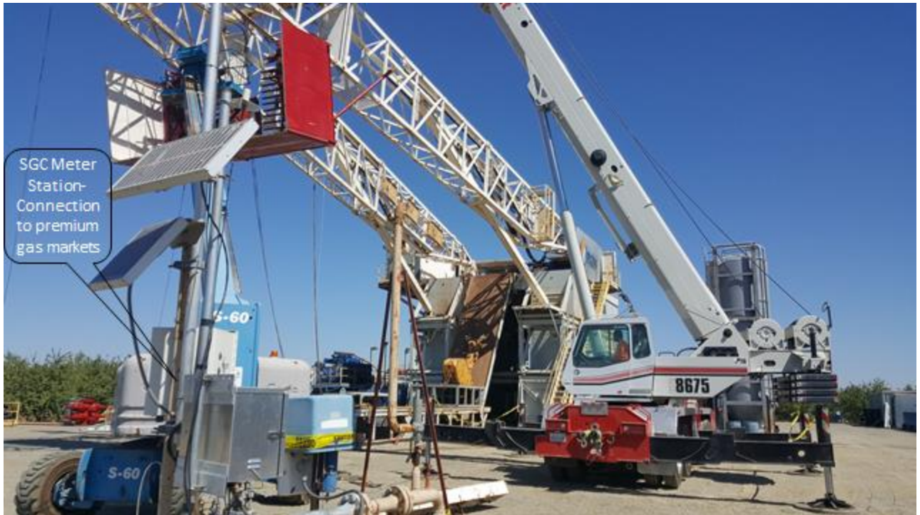
Figure 2: Drilling ahead - Graham Rig #9 at Dempsey 1-15