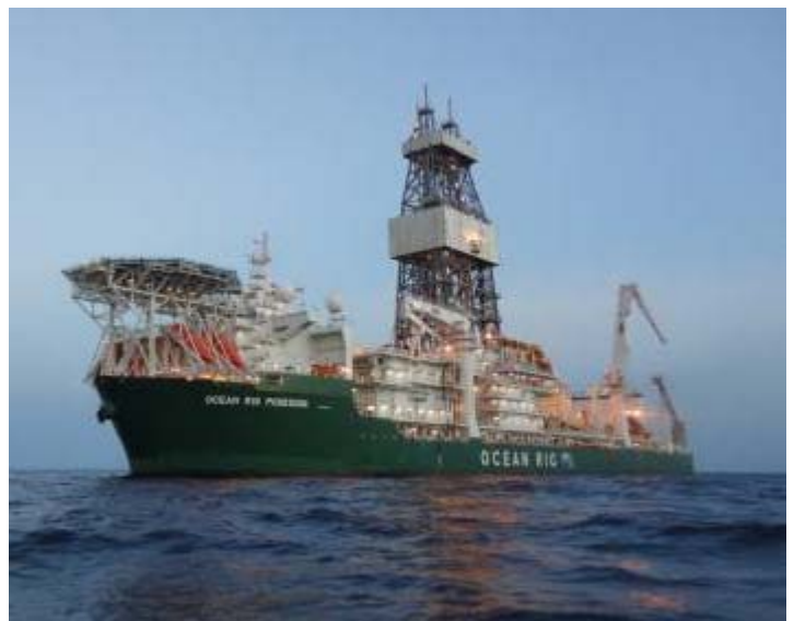
Ocean Rig Poseidon – Contracted to Drill Cormorant-1

In order to drill the well the Joint Venture was required to apply to the Ministry of Mines and Energy in Namibia for permission to enter the next phase of the licence, the Second Renewal Exploration Period. Permission has been granted and drilling preparations are well underway.