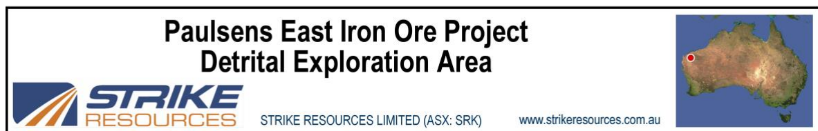
Figure 2 - Location of detrital exploration area

The area being investigated sits partially over the area of the open pit designed for the proposed main Paulsens East Mine - i.e. is surface material that would otherwise have been cleared as waste material as the main Project is developed (refer Figure 2).