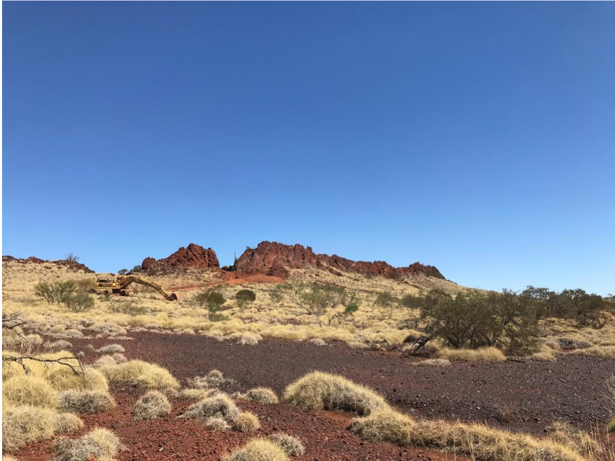
Figure 1 - Paulsens East Hematite Ridge with detritals in foreground

Results of laboratory testwork on the samples showed a highly encouraging product grade of 60% Fe, 6.4% SiO 2 and 3.4% Al 2 O 3 with a mass recovery of 83% on crushing to -32mm and simple wet screening at +1mm size.